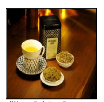
Silver Jubilee Pure Chamomile