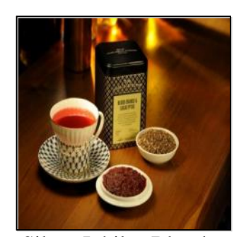
Silver Jubilee Blood Orange & Eucalyptus