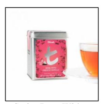
t-Series Rose With French Vanilla