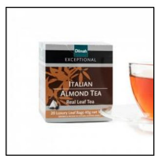
Exceptional Italian Almond Tea