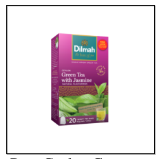
Pure Ceylon Green Tea with Jasmine flavour