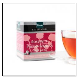
Exceptional Rose With French Vanilla