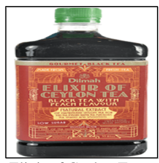
Elixir of Ceylon Tea Black Tea with Peach