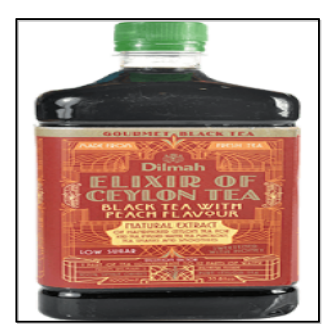
Elixir of Ceylon Tea Black Tea with Peach