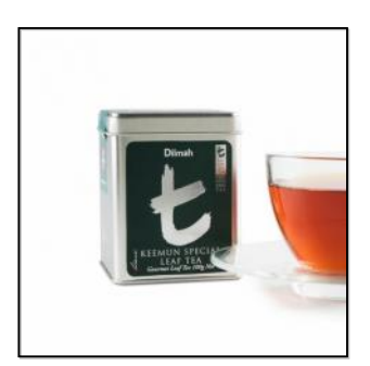
t-Series Keemun Special Leaf Tea