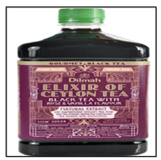
Elixir of Ceylon Tea Black Tea with Rose and Vanilla