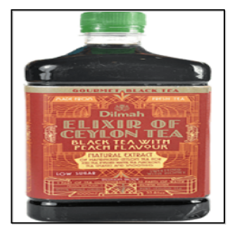
Elixir of Ceylon Tea Black Tea with Peach