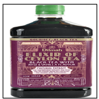
Elixir of Ceylon Tea Black Tea with Rose and Vanilla