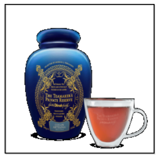
TPR Ceylon Artisanal Spice chai