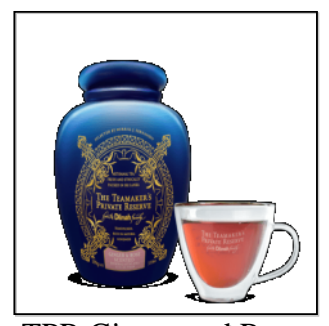
TPR Ginger and Rose scented Dombagastalawa Estate FBOP Ingredients