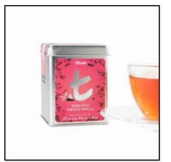
t-Series Rose With French Vanilla