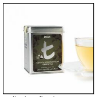
t-Series Ceylon Young Hyson Green Tea