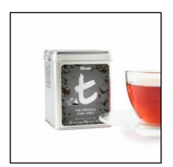
t-Series The Original Earl Grey