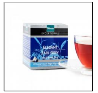
Exceptional Elegant Earl Grey