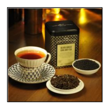
Silver Jubilee Earl Grey Tea