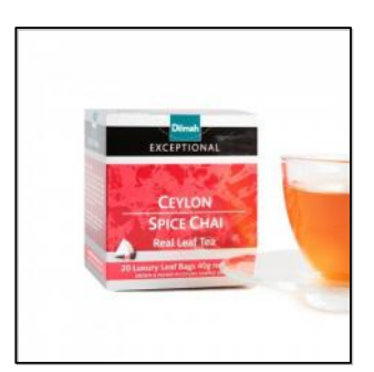
Exceptional Ceylon Spice Chai