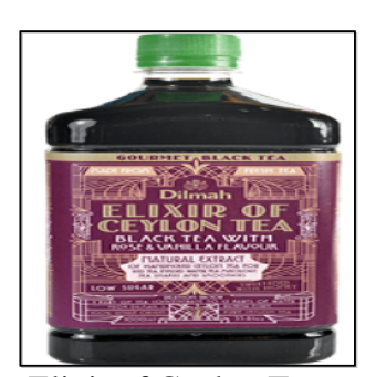
Elixir of Ceylon Tea Black Tea with Rose and Vanilla