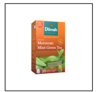
Pure Ceylon Green Tea with Moroccan Mint