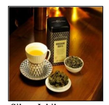
Silver Jubilee Moroccan Mint Green Tea