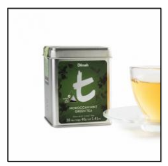
t-Series Moroccan Mint Green Tea