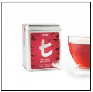
t-Series Brilliant Breakfast