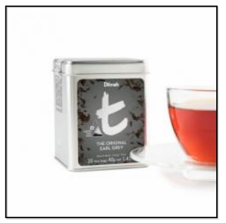
t-Series The Original Earl Grey