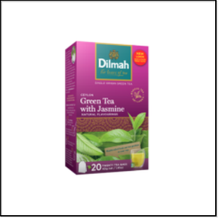
Pure Ceylon Green Tea with Jasmine flavour