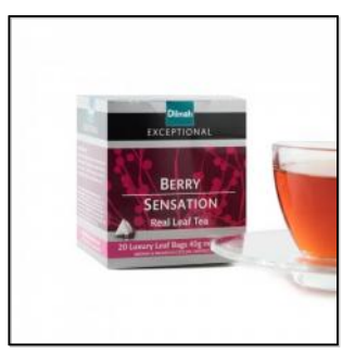
Exceptional Berry Sensation