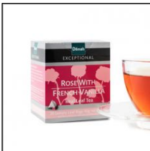
Exceptional Rose With French Vanilla