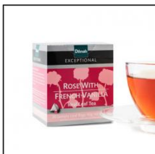
Exceptional Rose With French Vanilla