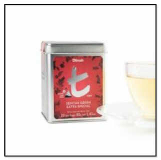
t-Series Sencha Green Extra Special