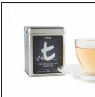
t-Series Ceylon Silver Tips White Tea