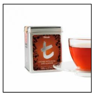
t-Series Lychee with Rose & Almond