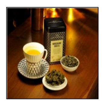
Silver Jubilee Moroccan Mint Green Tea