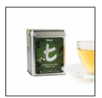
t-Series Moroccan Mint Green Tea