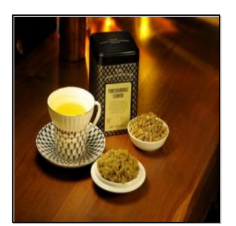
Silver Jubilee Pure Chamomile