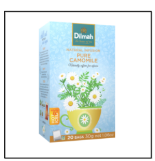
Natural Infusion Pure Camomile