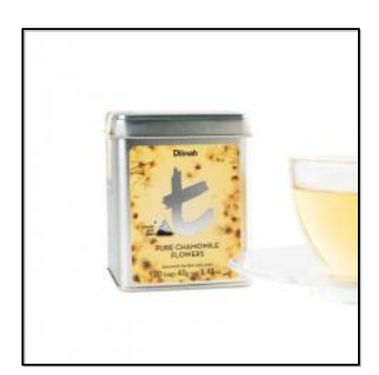
t-Series Pure Chamomile Flowers