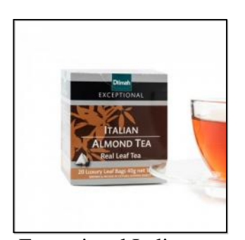
Exceptional Italian Almond Tea