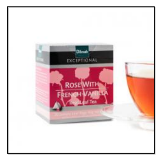
Exceptional Rose With French Vanilla