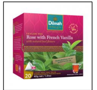
Rose with French Vanilla Tea with natural bael flowers