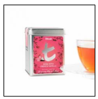
t-Series Rose With French Vanilla