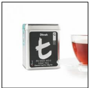
t-Series Pu-erh No. 1 Leaf Tea