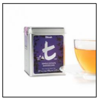
t-Series Single Estate Darjeeling