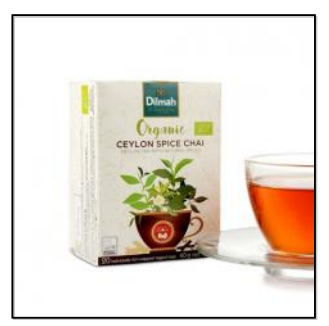
Organic Ceylon Spice Chai