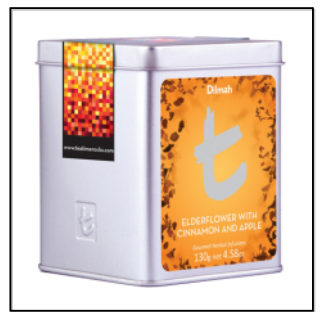
t-Series Elderflower with Cinnamon and Apple