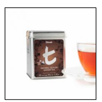
t-Series Natural Ceylon Ginger Tea