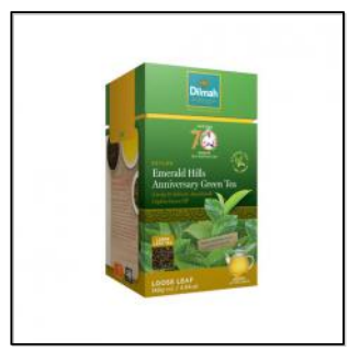
Emerald Hills Anniversary Green Tea