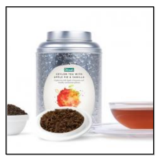
Vivid Ceylon Tea with Apple Pie & Vanilla