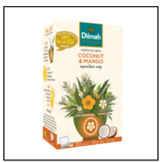
Green Rooibos Coconut & Mango