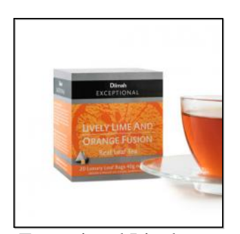
Exceptional Lively lime and Orange fusion