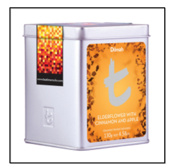
t-Series Elderflower with Cinnamon and Apple