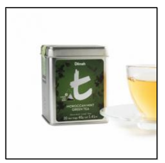
t-Series Moroccan Mint Green Tea