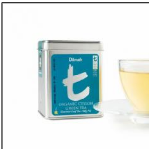
t-Series Organic Ceylon Green Tea