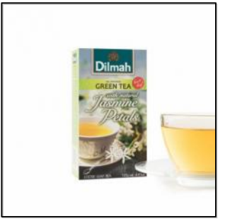
Green Tea with Jasmine Petals