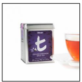
t-Series Ceylon Cinnamon Spice Tea