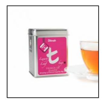
t-Series Prince of Kandy