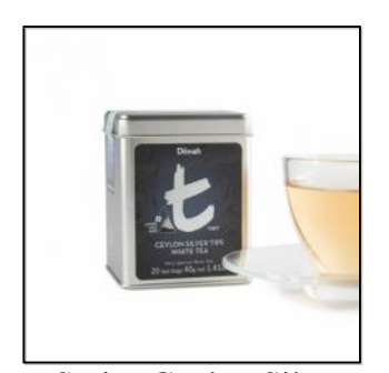
t-Series Ceylon Silver Tips White Tea