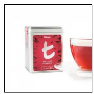
t-Series Brilliant Breakfast