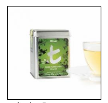
t-Series Pure Peppermint Leaves