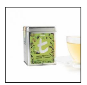
t-Series Green Tea with Jasmine Flowers