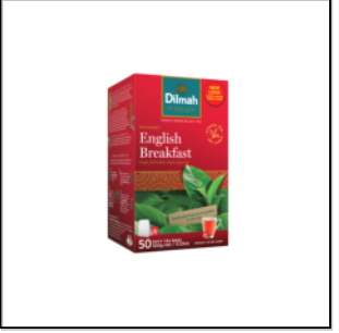
Gourmet English Breakfast